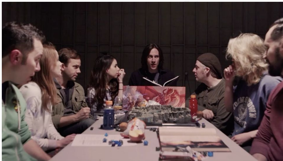
Geek & Sundry

More simply, it's an exciting game where you make up fun adventures with friends!